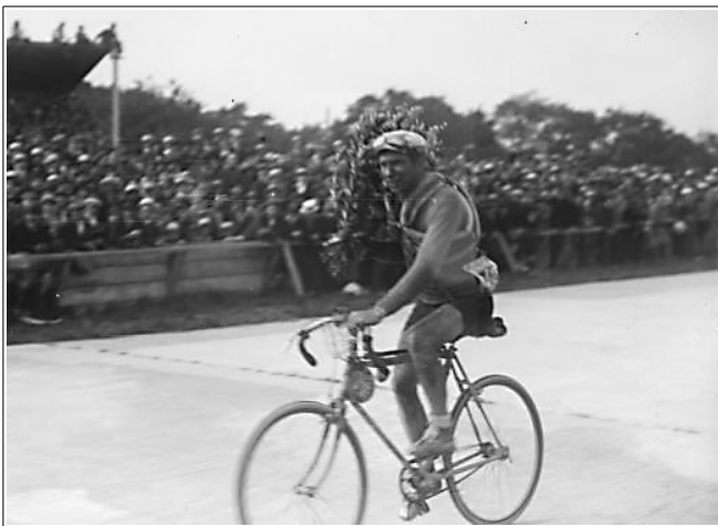
Belgian rider Firmin Lambot was the winner of the 1919 Tour, and made history as the first winner to cross the finish line wearing the Yellow Jersey.