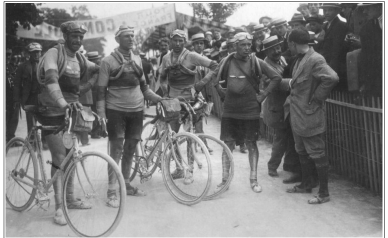
Riders, including Eugene Christophe (on the left), during the 1919 Tour de France. It was during this Tour that Christophe was presented with the 1 st Yellow Jersey.