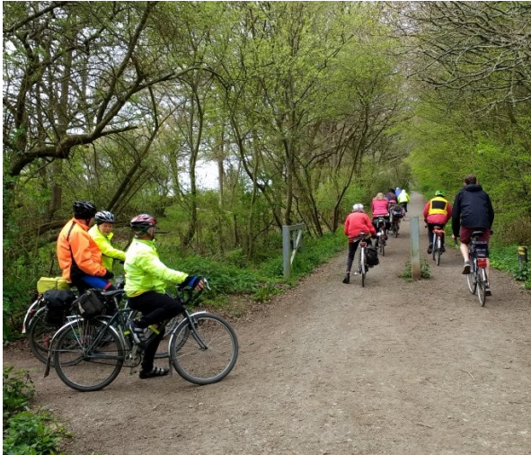
Midweek Easyriders in Robin Post Lane.